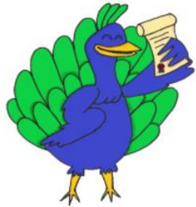
Persistent Peacock I never give up.