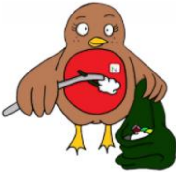
Responsible Robin I am a responsible citizen.

Shortly your child will come home with a set of Wow Moment cards. Please fill these out when your child learns to do something new or follows one of the school values. The school values are: