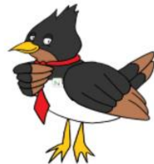
Confident Cuckoo I embrace change.

We will then celebrate these Wow Moments in class.