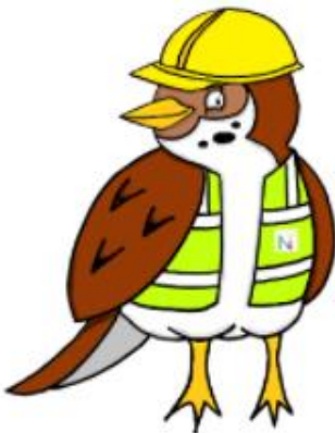
Safe Sparrow I keep myself and others safe.