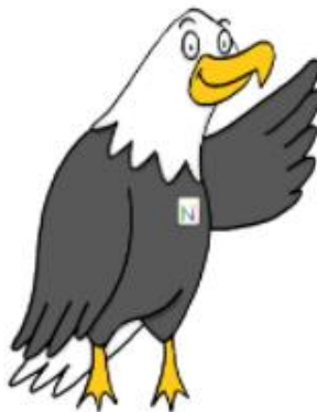
Friendly Falcon I am a good friend.